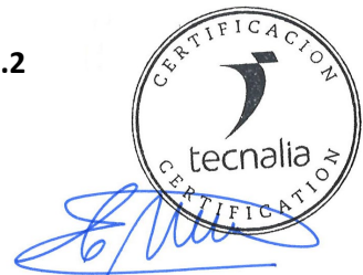
Carlos Nazabal Alsua Manager

Issued date / Fecha de emisión: 07/05/2024 Update date / Fecha de actualización: 07/05/2024 Valid until / Válido hasta: 06/05/2029 Serial N° / N° Serie: EPD1040100-E